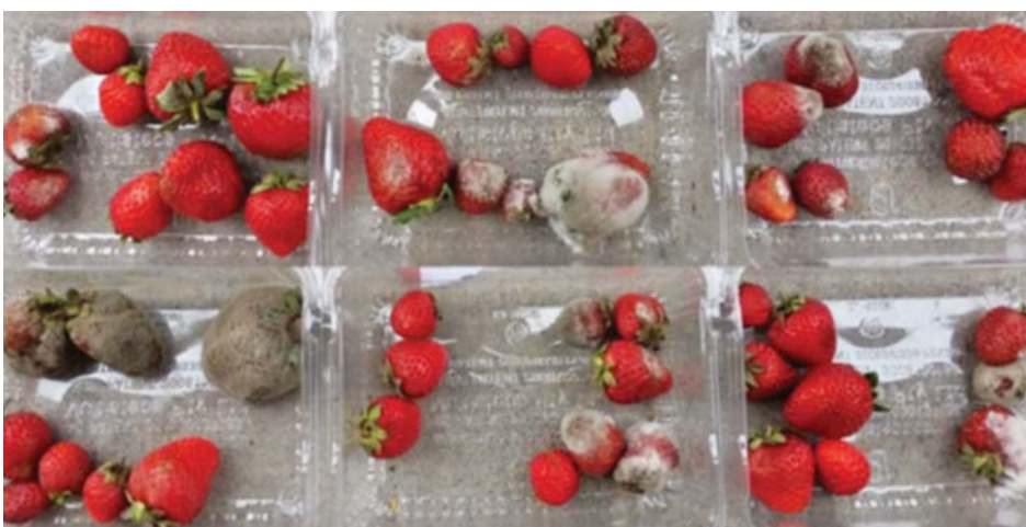
Figure 3: Fruit rots of strawberry following incubation for 7 days at 3-4°C, and then 4 days at 20°C. Treatment of strawberry plants with a seaweed extract (Seasol®) reduced the incidence of fruit rot by 11% (top punnets) compared with fruit from plants not treated with the extract (bottom punnets).