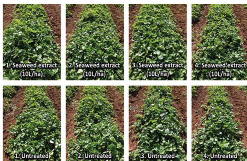
Figure 1: Four replicates of strawberry runners ( Fortuna ) treated with a seaweed extract ( Seasol ®) (top), or not treated with the extract (bottom) in a field trial at Toolangi, Victoria. The extract increased runner yields in the trial.

We found that the application of the seaweed extract increased runner yields by 8%, depending on the variety in the trial. The extract had the greatest effect